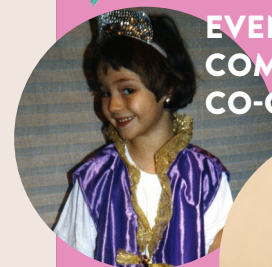
EVENT COMMITTEE CO-CHAIRS